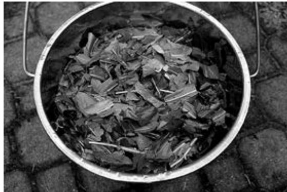
2. The leaves are harvested and torn by hand into small pieces, then rinsed to remove any dirt.