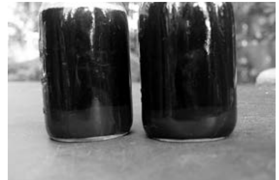
6. The blue liquid is then transferred to jars so the dye can precipitate over many hours. The clear liquid is decanted off and the blue slurry is put in a large non-stick frying pan to allow the remaining water to evaporate off, leaving ... woad!