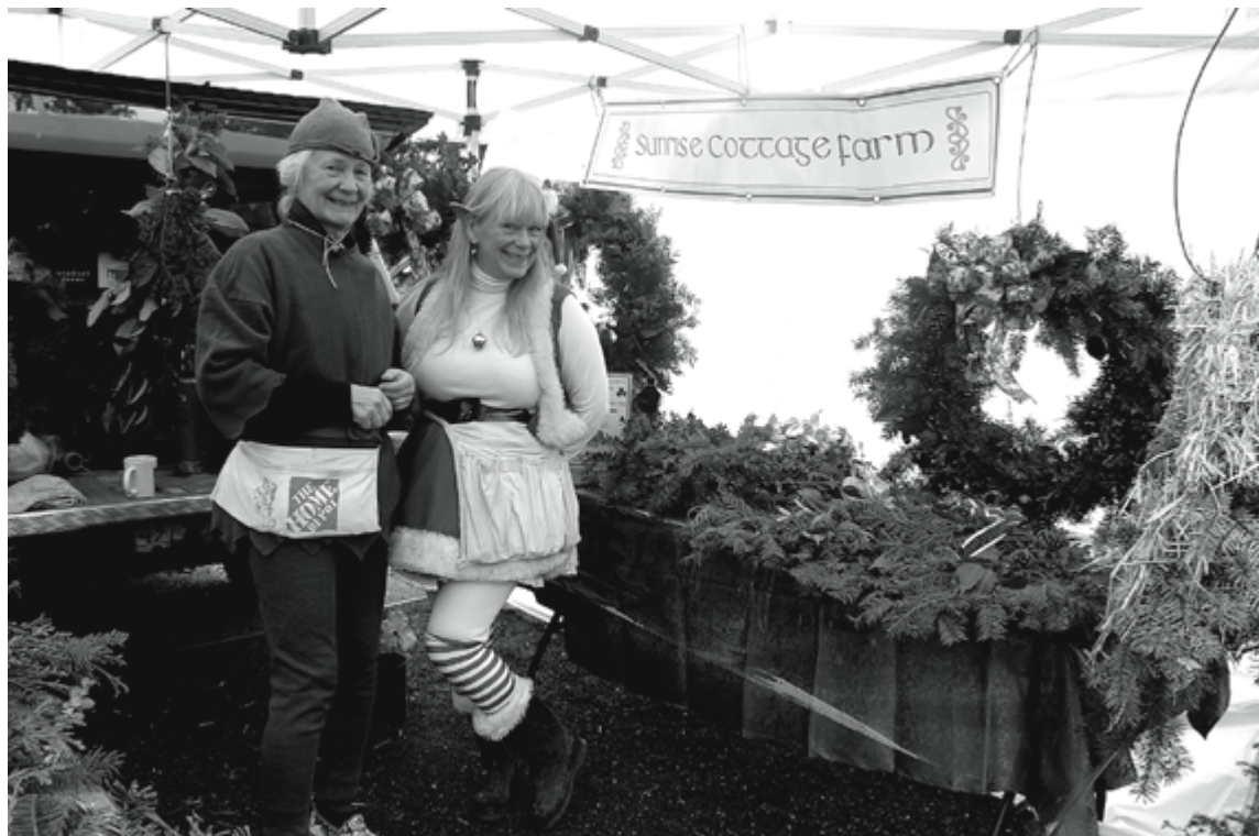
The Metchosin Producers Association sponsored the First-Ever Christmas Market on the Municipal Grounds and a good time was had by all.