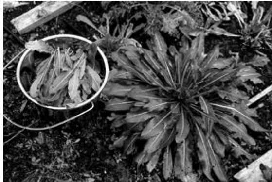
1. The woad plant is 40 to 50 centimetres in diameter, with long, spoon-shaped leaves.

I was fortunate to discover that Metchosin Farm had, amongst its extensive collection of seeds, woad seeds, so decided to "Hit the Woad, Jack!" I got a package and started some seeds under lights, then transplanted the starts when the soil was warm enough, and the game was on: