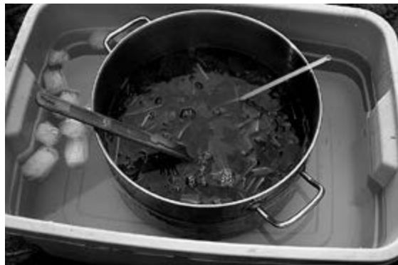
4. After brewing for 10 minutes, the tea is cooled in an ice bath in order to prevent the dye from breaking down.