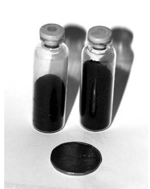
7. This picture shows why woad was so valuable. That's a loonie in front of the vials for comparison. Not a lot of the stuff for a considerable amount of work!