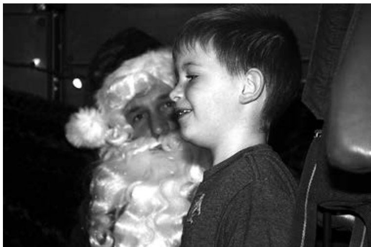
On December 20, comfortably set up in Engine #4, Santa listened to young visitors as they told him they had been good and deserved a visit on Christmas Eve. A pancake breakfast followed.