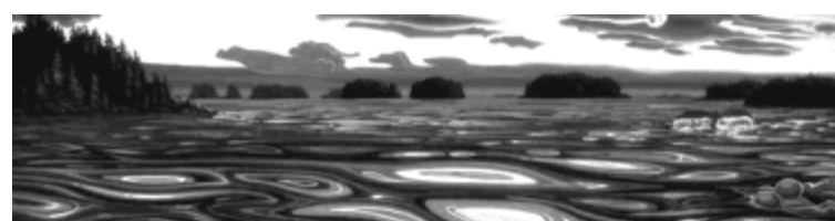
One of 50 artists' contributions painted on the Reflections voyage to Klemtu.

This has left many individuals and grassroots groups excluded from sharing their opinions within the review process. Directly Affected is Raincoast's response to the frustration felt by communities across BC who want to have their voices heard.