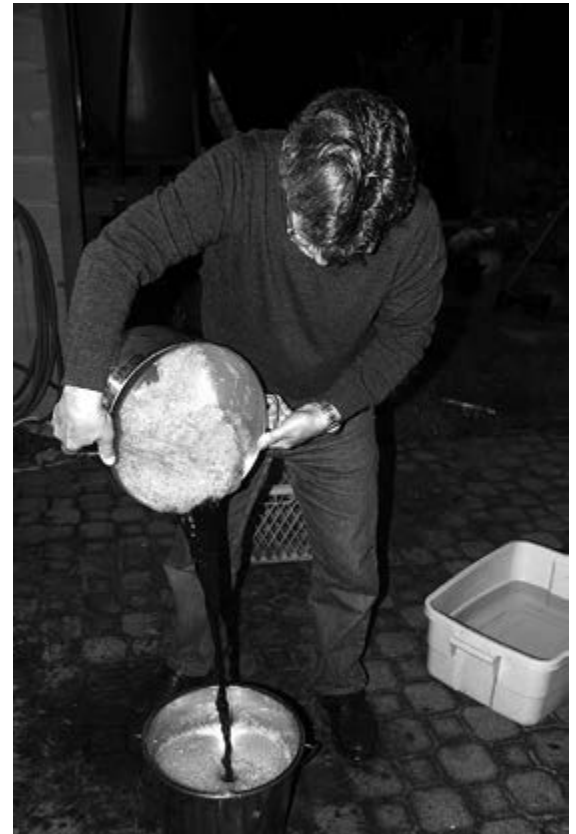
5. Here's where the magic starts. The leaves are strained out and put in the compost. Three teaspoons of soda ash are mixed into the remaining liquid, and it is then aerated by pouring it back and forth between buckets. It bubbles and froths, and turns from green-yellow to a dark blue.