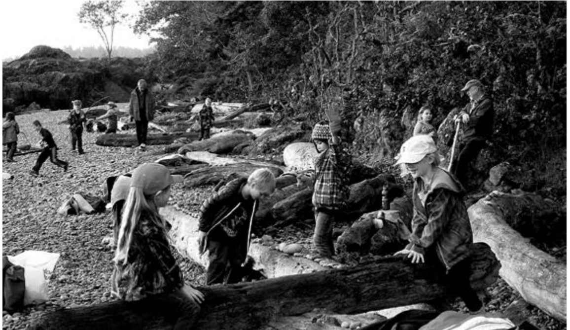
Hans Helgesen students on the beach at Devonian Park.