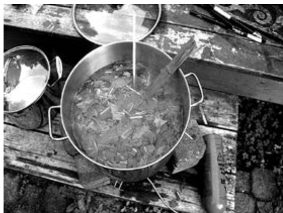
3. The shredded leaves are steeped in 90°C water for 10 minutes. Not 95°C, not 85°C water, exactly 90°C water. If the water is too hot, the dye is destroyed. If it is too cool, the dye is not extracted adequately.